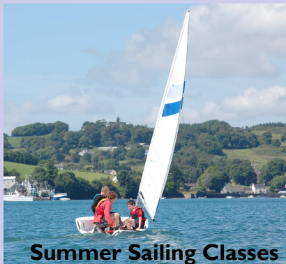
Summer Sailing Classes

In our School Mission Statement we commit ourselves to providing the best possible education for each child in a safe, secure, happy environment. We strive to develop every aspect of the child, including their social, emotional, spiritual and educational development. There is a family atmosphere in the school.